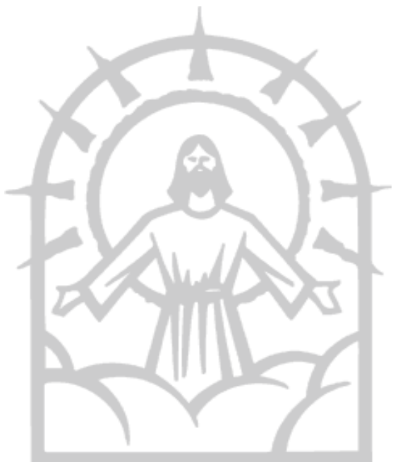
ASCENSION May 17, 2007