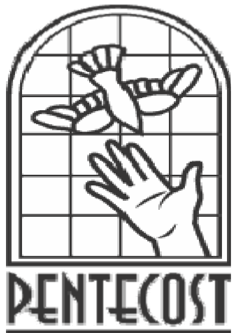
May 27, 2007

Extra copies are available in the Narthex.