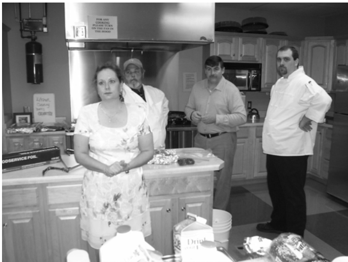
Kitchen Crew—Easter Breakfast