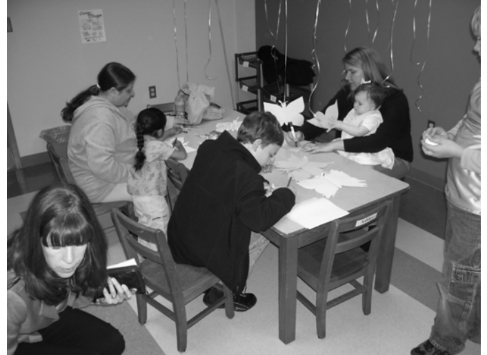
Children's activities—Easter Sunday—2007